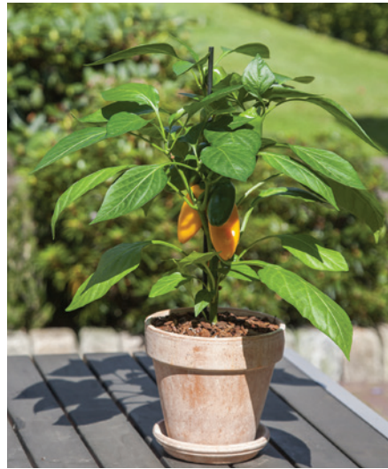
65-7191-UNT Fresh Bites F1 Yellow