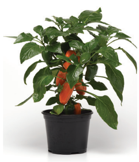
65-7192-UNT Fresh Bites F1 Orange

New collection with 3 colours of small and sweet snacking peppers. These very compact plants produce quickly and offer an abundant harvest, concentrated over a short period of time.