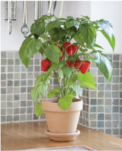
65-7190-UNT Fresh Bites F1 Red