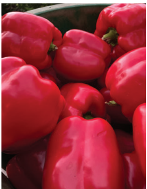
65-7231-UNT Sweet Pepper Sailfish X10R F1 Red

Maturity : 55 days • Fruit dimensions (length x diam.): 8 x 3 cm